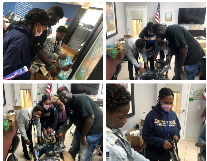
Packing emergency hurricane kits for families in the community.

THE ARC IS ALWAYS IN NEED OF ESSENTIAL ITEMS AFTER HURRICANES, INCLUDING BATTERIES, NONPERISHABLE FOOD, AND WATER. DON'T FORGET ABOUT YOUR FRIENDS AT THE ARC WHEN YOU STOCK UP ON YOUR OWN SUPPLIES. WE WILL REACH OUT AFTER A HURRICANE FOR SUPPLIES TO AID OUR CLIENTS AND FAMILIES IN NEED OF ASSISTANCE.